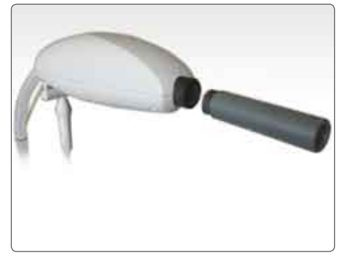
Fast and easy automatic calibration

Antibacterial filter is strongly recommended for the prevention of cross contamination